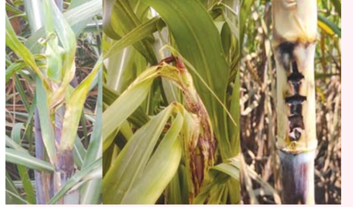
पोक्का बोंग रोगाची लक्षणे ऊसाच्या कांड्यांवर कांडी काप (नाइफ कट)

त्यामुळे कांड्या आखुड व वेड्यावाकड्या होतात. कधी कधी रोगाची तीव्रता वाढल्यामुळे पोंगा मर किंवा शेंडा कुज दिसून येते. काही वेळेस रोगग्रस्त ऊसाच्या कांड्यांवर कांडी काप (नाइफ कट) सारखी लक्षणे दिसून येतात. शेंडा कुज व कांडी काप (नाइफ कट) झालेल्या ऊसाचा शेंडा जोम नष्ट झाल्याने ऊसावरील डोळ्यातून पांगशा फुटतात व कालांतराने असे ऊस वाळतात. रोगट ऊसाच्या कांड्या आखुड झाल्याने व पांगशा फुटल्याने उत्पन्नात घट येते. रोगाचा प्राथमिक प्रसार हवेमार्फत, तर दुय्यम प्रसार पाणी, पाऊस व किटकाद्वारे होतो.