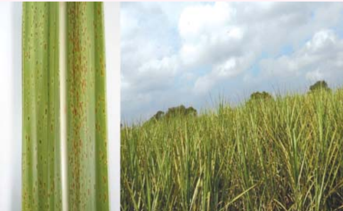
तपकिरी ठिपके रोगाची लक्षणे

या रोगाची लागण महाराष्ट्रात पावसाळा हंगामात जुलै महिन्यापासून दिसून आलेली आहे. सध्यातरी या रोगाचा प्रादुर्भाव पावसाळा हंगामात दिसून येतोय. रोग करण्याच्या बुरशीची लागण सर्वप्रथम जुन्या पानांवर होते. रोगाची लागण पानावर झाल्याने लाल-तपकिरी रंगाचे ठिपके उसाच्या पानांवर दिसून येतात. ठिपक्यांचा आकार टाचणीच्या टोकापासून ते ३ ते १५ मिमि इतका आढळतो. पानावरील ठिपके अंडाकृती किंवा लंबगोलाकार असून त्यांच्या सभोवतालचा भाग पिवळा दिसतो. जुन्या ठिपक्यांचा मध्य भाग वाळलेल्या काडासारखा, त्याबाहेरील भाग लाल आणि शेवटचे आवरण पिवळे दिसते. सामान्यपणे पानाच्या दोन्ही बाजूस ठिपके सारखेच दिसतात. उसाच्या कोवळ्या पानांपेक्षा जुन्या पानांवर ठिपके जास्त प्रमाणात दिसतात; तसेच ठिपके पानांवर सर्वत्र सारख्या प्रमाणात विखुरलेले आढळतात. रोगाची तीब्रता वाढल्यावर ठिपके पानाचा पूर्ण भाग व्यापतात आणि ते एकमेकात मिसळतात. तदनंतर पाने पूर्णपणे करपतात आणि वाळतात. दूरवरून रोगग्रस्त पिक तांबेरा रोगाने ग्रासल्यासारखे दिसते. पाणांची पूर्ण वाढ होण्याआधीच पाने पिवळी पडतात आणि पानाकरवी होणारे प्रकाश संश्लेषणाचे आणि साखर तयार करण्याचे काम मंदावते किंवा थांबते. पर्यायाने पिकाचे उत्पन्न घटते. ऊस पक्कतेच्या काळात या रोगाची तिब्रता वाढते; ही खरी चिंतेची बाब आहे. ऊस जातनिहाय रोगाची तीब्रता कमीअधिक आढळते. हा रोग फक्त पानावरच मर्यादित आहे.