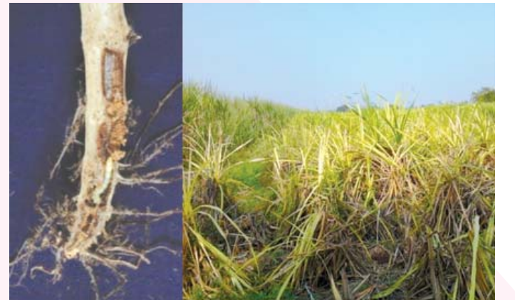
मर रोगाची लक्षणे

मर हा रोग व फ्यूजॅरियम सॅकॅराय या जमिनीद्वारे पसरणाऱ्या बुरशीमुळे होतो. जमिनीतील कांड्या पोखरणाऱ्या अळीचा (रूट बोरर) प्रादुर्भाव झाल्यास किंवा अन्य काही कारणाने उसाच्या जमिनीतील कांड्यास इजा झाल्यास या रोगास कारणीभूत असणाऱ्या बुरशीचा शिरकाव होतो व रोगाची लागण होते. अनेक ऊस जाती या रोगास बळी पडतात. महाराष्ट्रात या रोगाचा प्रादुर्भाव ऊस पिकावर कमी प्रमाणात आहे.