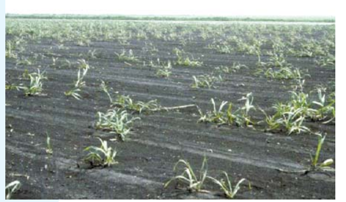
शेतात तुटाळी तयार होते.

आतून सुरुवातीस तांबूस लालसर पडतात व नंतर काळ्या पडतात. कुजलेल्या कांड्यांचा वास अननसासारखा येतो. भारी जमिनीत खोलवर लागण झाल्यास या रोगाची शक्यता अधिक असते. पूरग्रस्त भागात व दलदलीच्या ठिकाणी नवीन लागवडीत हा रोग वाढण्याची शक्यता असते. या रोगामुळे उसाच्या उगवणीवर प्रतिकूल परिणाम होवून शेतात तुटाळी तयार होते.