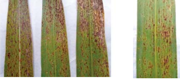
तांबेरा रोगाची लक्षणे